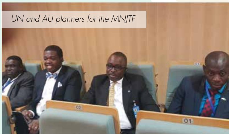
UN and AU planners for the MNJTF