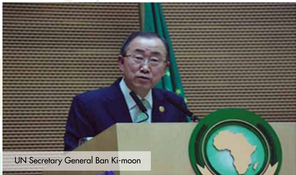
UN Secretary General Ban Ki-moon

The 26 th African Union January Summit was opened on 30 January 2016 in Addis Ababa, with UN Secretary General Ban Ki-moon. The AUC Chairperson, Nkosazana Dlamini-Zuma in her opening remarks, observed that under Agenda 2063, Africa refuses to be indifferent or silent in the face of violent extremism, gender based violence, and the suffering caused by wars and conflict, adding that Africa has pledged to leverage its diversity as a force for peace and democracy. The Chairperson acknowledged the need to create opportunities for young people in order to address root causes of conflict. She also strongly called on the UN to find a solution to the decades-old crisis in Western Sahara so as to forestall the risk of youth radicalization in refugee camps. She welcomed newly elected Heads of State, John Magufuli of Tanzania and Mr. Roch Marc Christian Kabore of Burkina Faso as