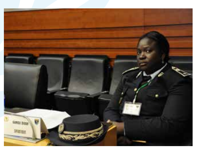
Course participant, Superintendent Sanou Diouf of Senegal

UNOAU Bulletin - November 2017 - January 2018