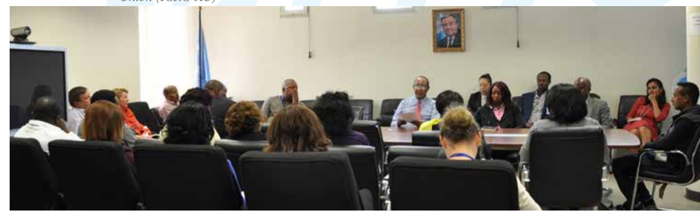
Staff hear from SRSG Menkerios during the quarterly UNOAU Town Hall Meeting