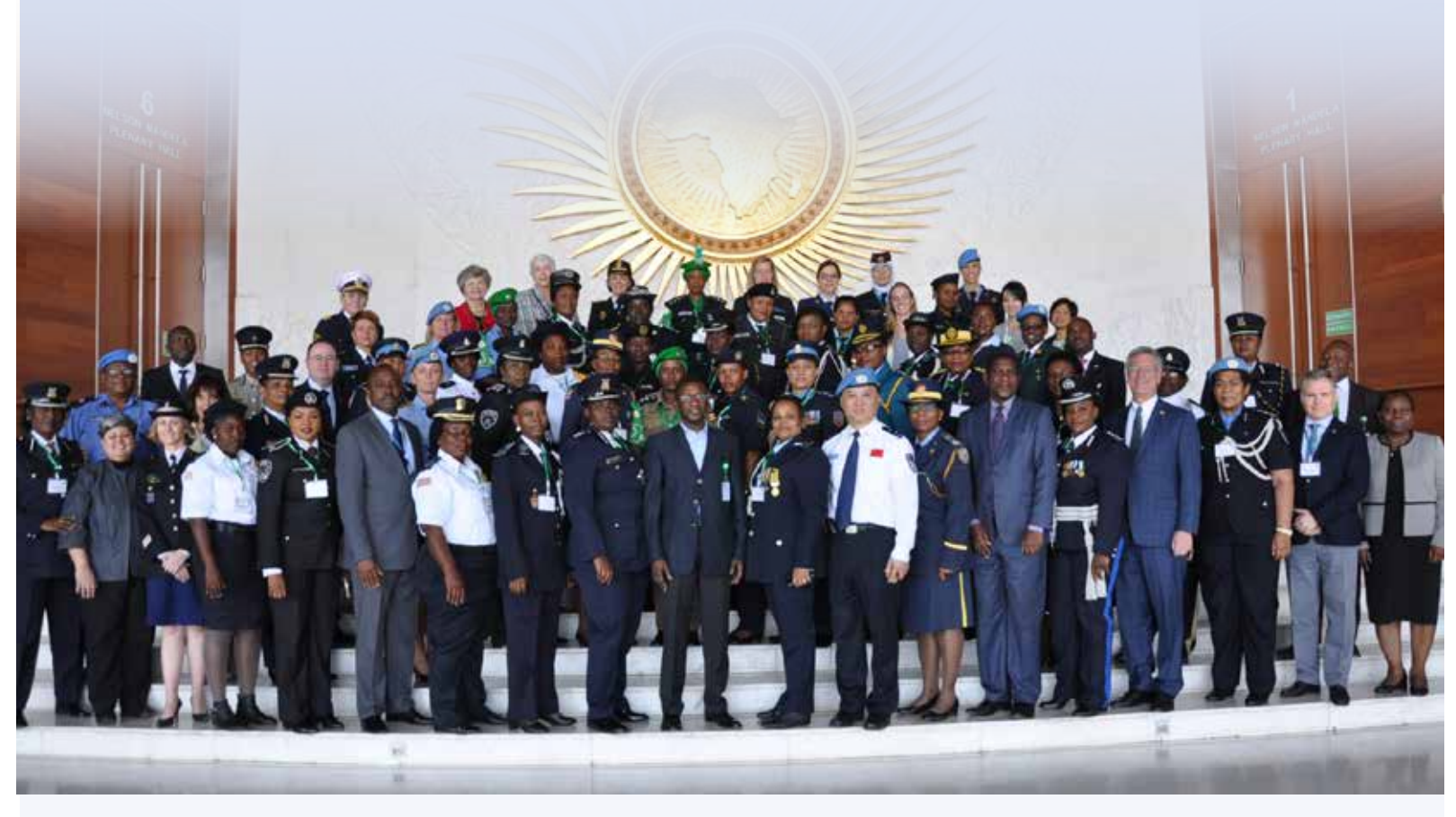
Participants pose for a group photo with the Ambassador of Canada, the Director of AU Peace and Security Department and the UN Deputy Police Adviser

United Nations Police Launches First Ever Female Senior Police Officers Command Development Course