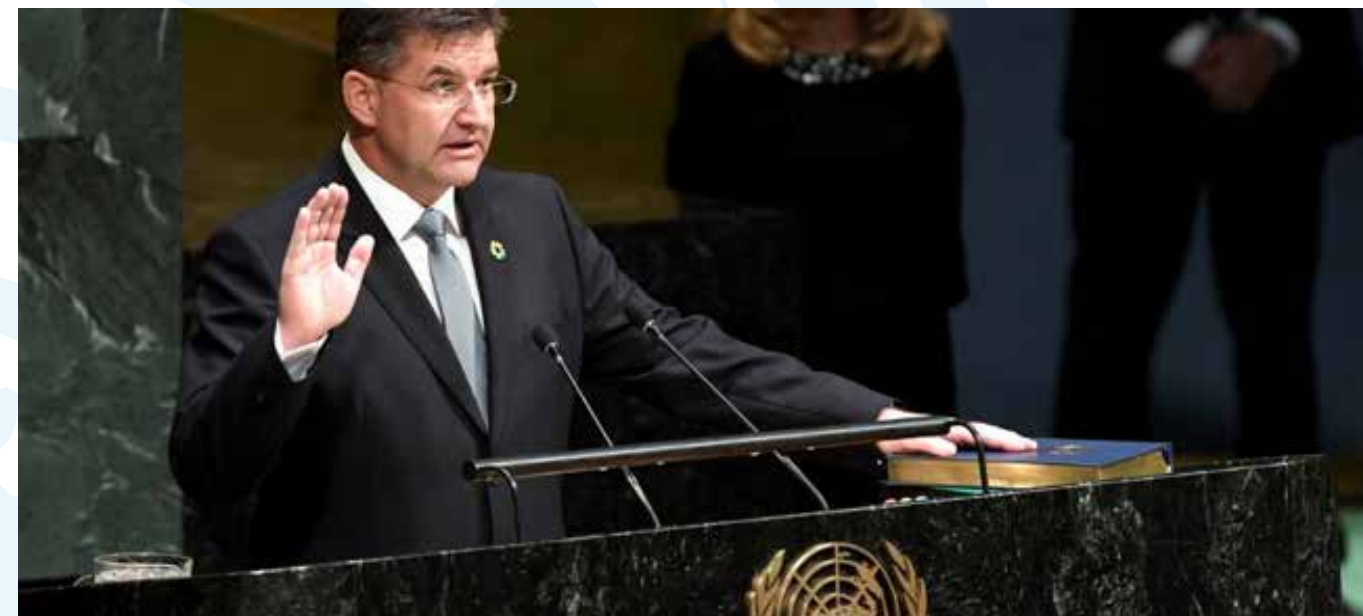
H.E. Miroslav Lajčák was sworn in as the new President of UN General Assembly (72nd session) on 11 September, 2017

In 2007, Mr. Lajčák was appointed High Representative of the International Community and European Union Special Representative in Bosnia and Herzegovina. During his tenure, Bosnia and Herzegovina signed the landmark Stabilization and Association Agreement with the European Union. From 2009 to July 2010, Mr. Lajčák served as Minister of Foreign Affairs of the Slovak Republic.