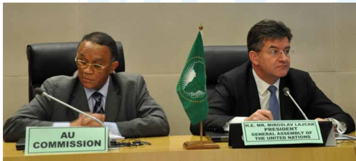
President Miroslav Lajčák was briefed by Commissioners at the African Union on trade, industry, social affairs among other priorities of the African Union Commission. H.E. Victor Harrison, Commissioner for Economic Affairs at African Union (left) chaired the session

In a meeting with African Union Commissioners for infrastructure, trade and social affairs, President Lajčák engaged the Commissioners in crucial global issues such as the Sustainable Development Goals, migration, trade, employment and labor, energy, youth and water were explored.