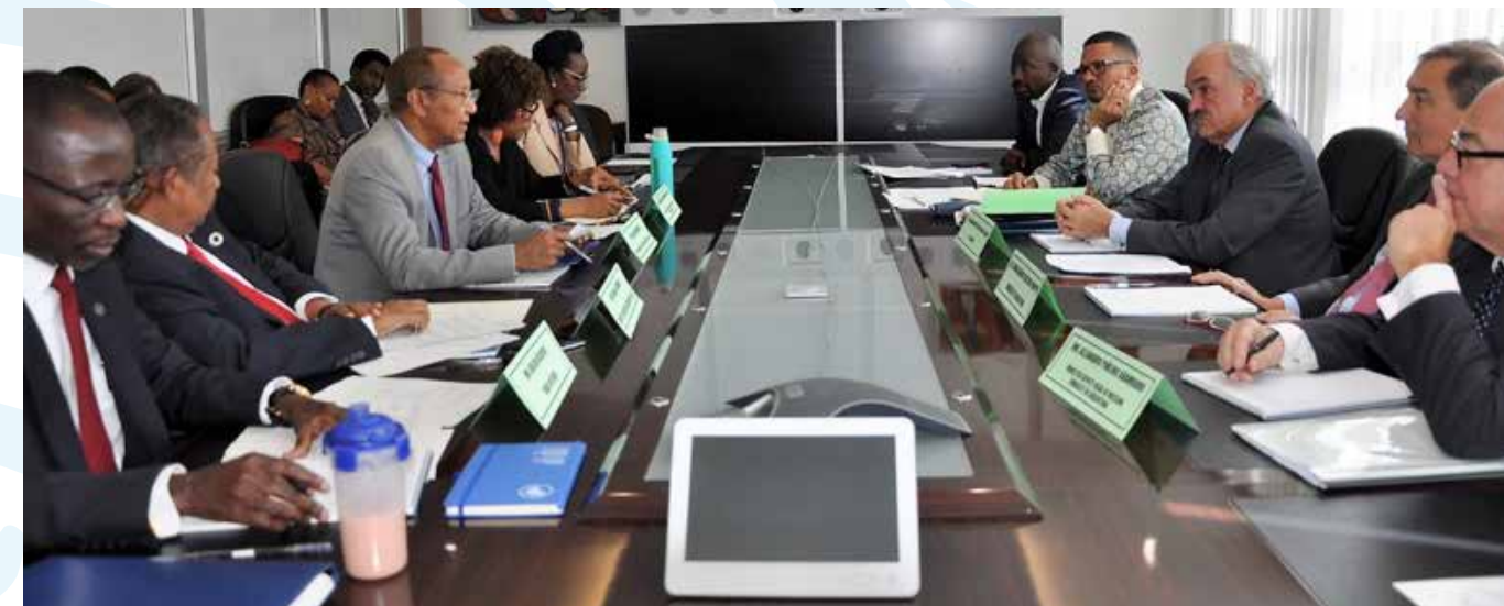
SRSG Haile Menkerios briefing G20 Argentina Sherpa, Ambassador Pedro Villagra Delgado at the Economic Commission for Africa