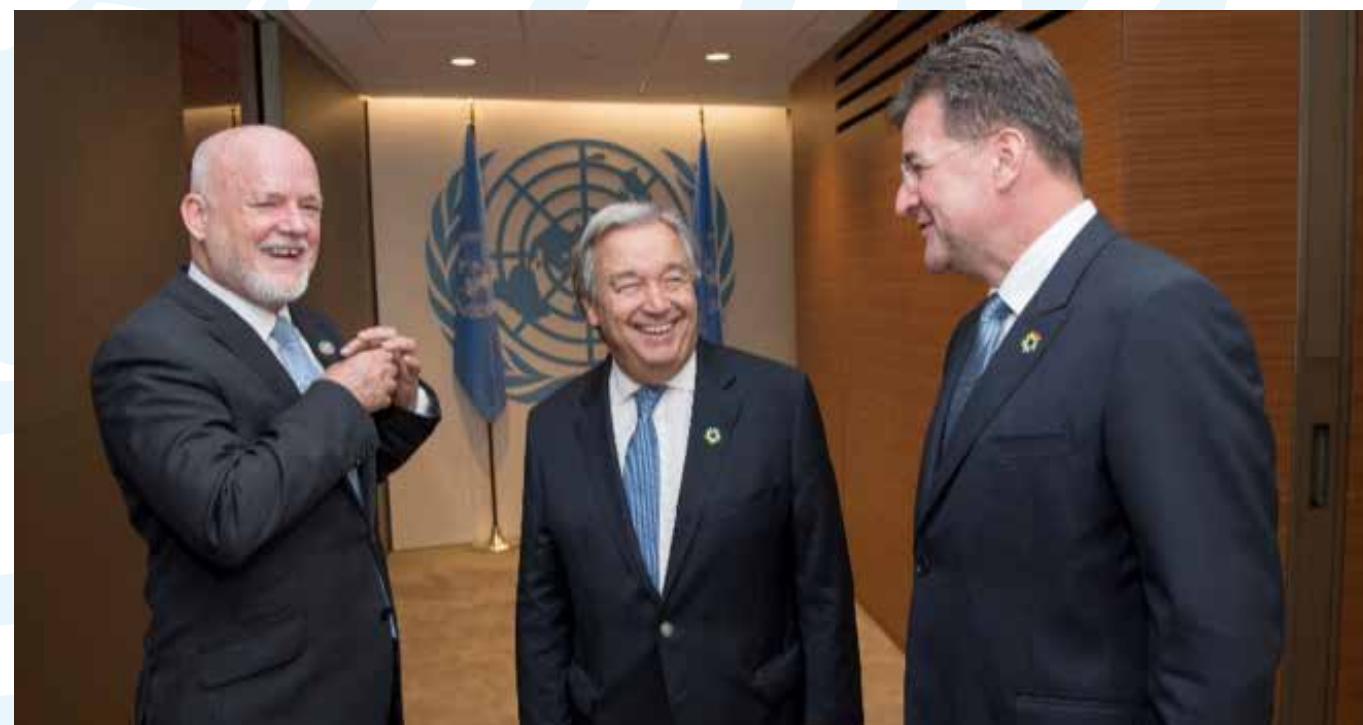
Mr. Peter Thomson, President of the 71 st General Assembly (left), UN Secretary-General, Antonio Guterres and Mr. Miroslav Lajčák, President of the 72 nd General Assembly

Mr. Lajčák is a graduate of the Moscow State Institute for International Relations and has a law degree from the Comenius University in Bratislava. He is married and has two daughters.