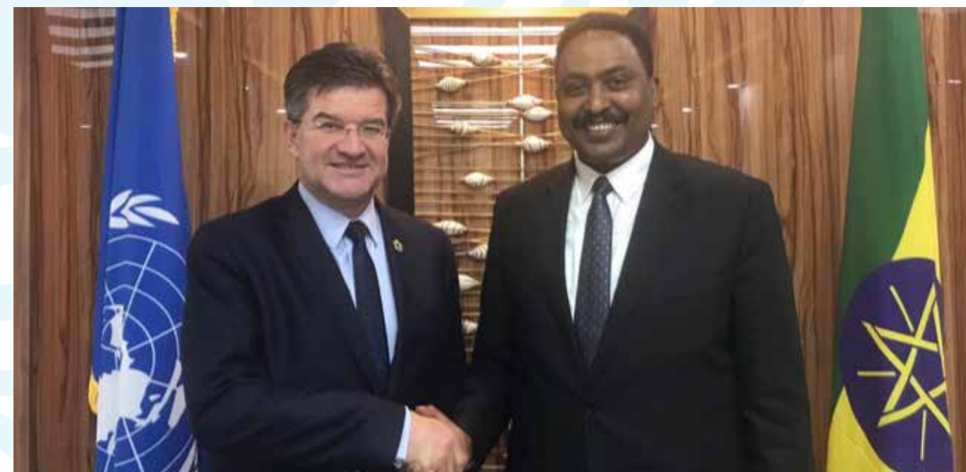
President Miroslav Lajčák with the Foreign Minister of Ethiopia, Workneh Gebeyehu

In a meeting with the Minister of Foreign Affairs of Ethiopia, Dr. Workneh Gebeyehu, President Lajčák discussed conflict prevention, developments in the Horn of Africa, poverty as a security threat, opportunities for youth and the on-going UN Security Council reform.