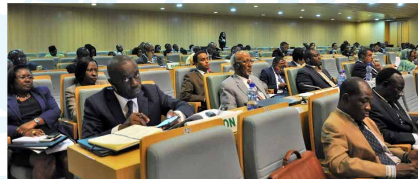
Some members of the African Union Permanent Representatives Committee

President Lajčák further underscored that, ‘When Africa acts, we all watch - and we all learn. Partnerships between AU and UN are a necessity. The United Nations cannot achieve any of its goals without Africa!’