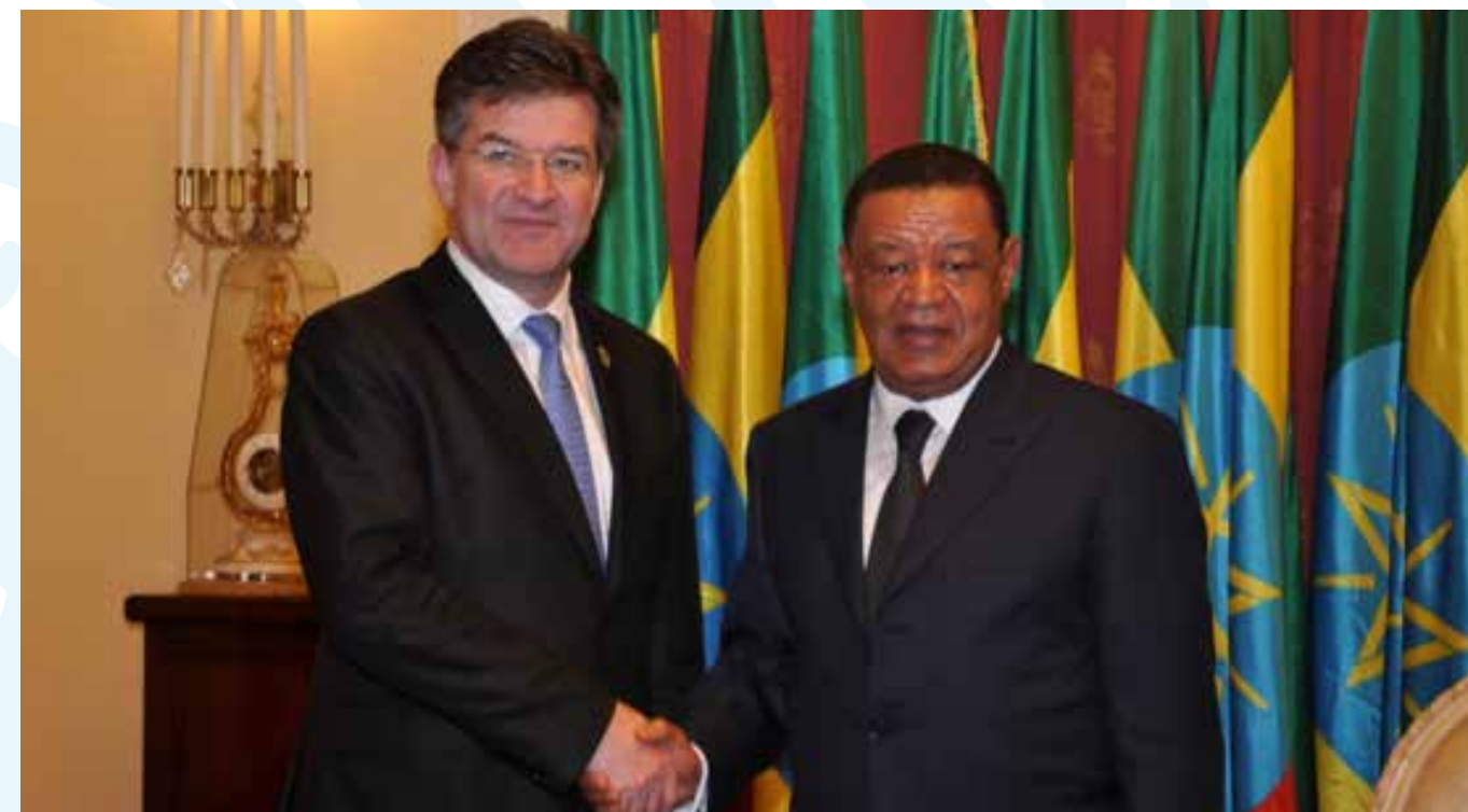
President Miroslav Lajčák with the President of Ethiopia, H.E. Mulatu Teshome

On 1 st March 2018, President Lajčák was received by the President of the Federal Republic of Ethiopia, H.E. Mulatu Teshome at the National Palace. The two leaders exchanged views on the Global Compact on Migration, Sustaining Peace, financing for Sustainable Development Goals, UN reforms and joint support for multilateralism.