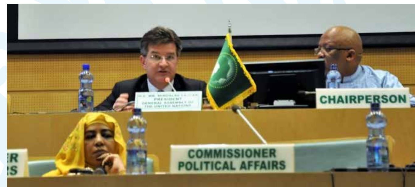
President Miroslav Lajčák addressing Permanent Representatives Committee at the African Union Commission

In his meeting with the African Union Permanent Representatives Committee (PRC), the President of the General Assembly stressed the importance of AU and African Member States' engagement in a number of upcoming high level events and negotiation processes, including the global compact for migration, the sustaining peace agenda, and the reform of the UN system.