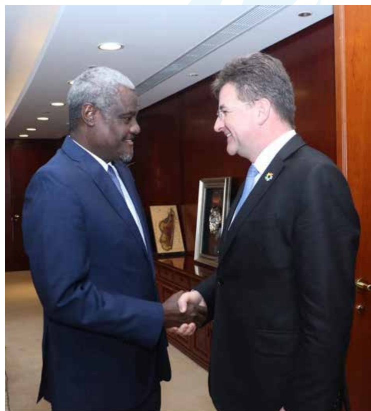
The Chairperson of the African Union Commission, H.E. Moussa Faki Mahamat receiving H.E. President Miroslav Lajčák in his office at the African Union Headquarters

The President of the UN General Assembly (PGA) met with the African Union Chairperson, H.E. Moussa Faki Mahamat.