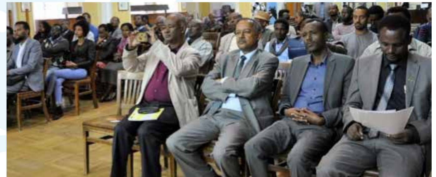
Graduate students and professors at Addis Ababa University who attended the interactive session with President Lajčák

At Addis Ababa University, President Lajčák interacted with students and professors from several graduate schools. Outlining the priorities of his presidency, Mr. Lajčák highlighted the relevance of the UN and how the Organization implements its set priorities. The need to work collaboratively to achieve and sustain peace; the Sustainable Development Goals, and the need to ensure safe migration were some of the other points that the PGA raised at the University.