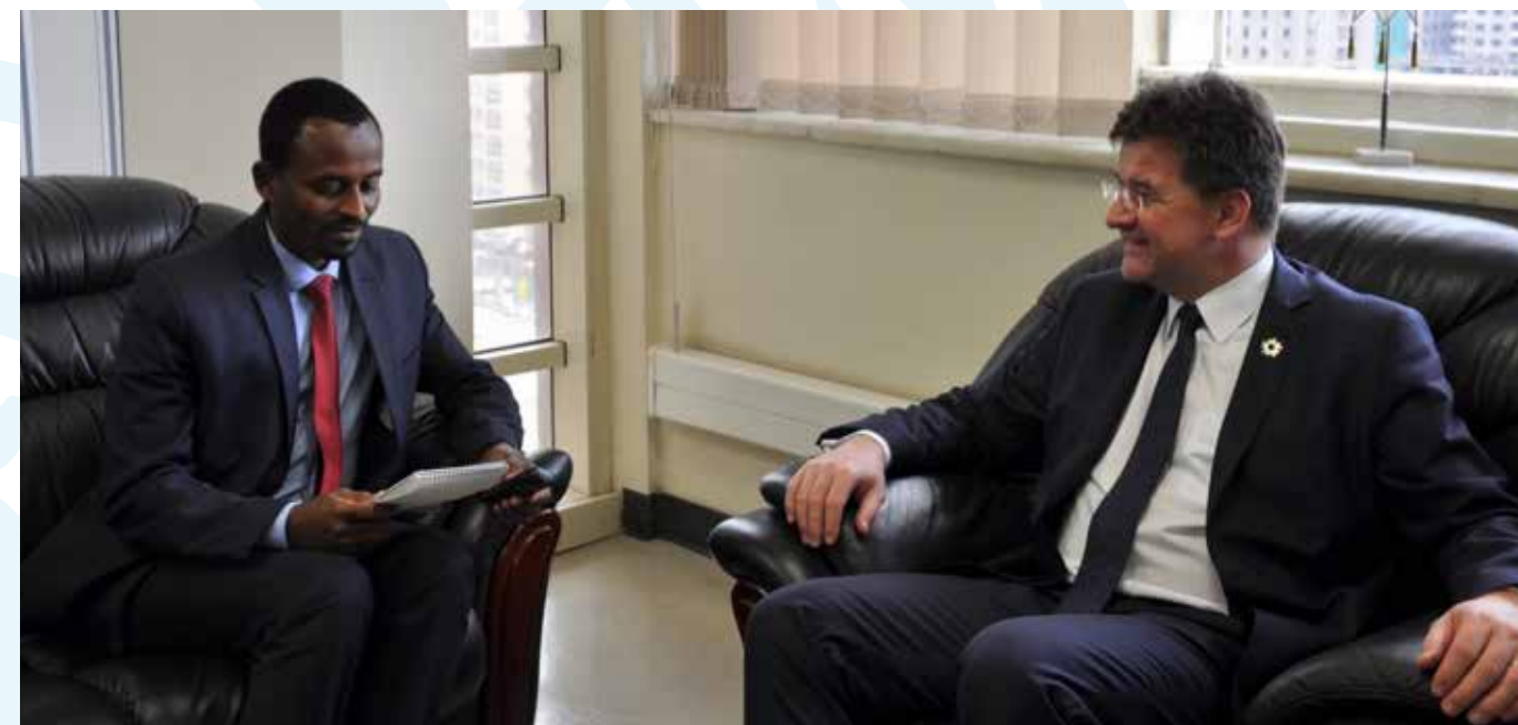
H.E. Mr. Miroslav Lajčák, President of the UN General Assembly with the Deputy Editor of the Ethiopia Herald newspaper at UNOAU premises

Ethiopia has a significant contribution to the UN agenda. The country has an active role in peace and security on the continent. It is actively implementing the Sustainable Development Goals in addition to promoting good governance.