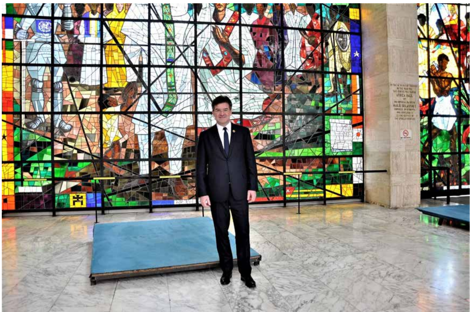
H.E. Mr. Miroslav Lajčák in Africa Hall at the United Nations Economic Commission for Africa, Addis Ababa