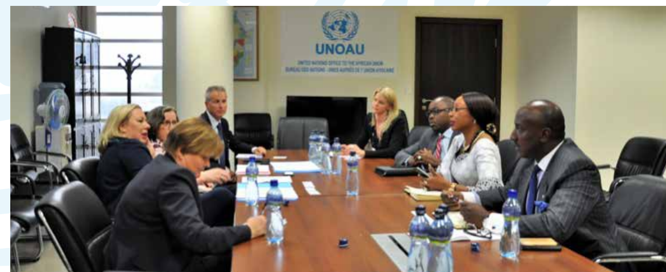
UNOAU senior management meeting with H.E. Ms. Jutta Urpilainen, Special Envoy of the Minister of Foreign Affairs of Finland