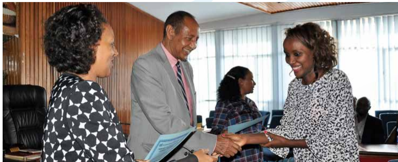
Mr. Haile Menkerios, the Special Representative of the Secretary-General to the African Union joins State Minister Hirut Zemene in a certificate handover ceremony at the Ethiopian Ministry of Foreign Affairs where up and coming diplomats attended a training conducted by the UN Department of Political Affairs and UNOAU