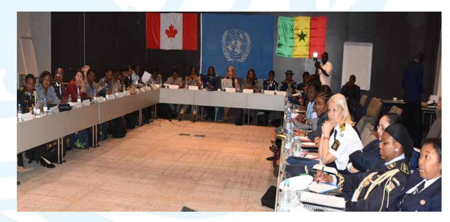
The opening ceremony of the Third Senior Female Police Officers Command Development Course held in Dakar, Senegal

She co-facilitated sessions and activities in which participants were assisted to formulate UN recruitment documentation, including Employment and Academic Certification (EACs) and practice competency-based interviews. Sessions that covered the Strategic Guidance Framework on international policing, introduction to UNPOLICE mandate in UN missions in Mali, Central African Republic, the Democratic Republic of Congo, and so forth. A final assessment was conducted from which 13 officers were considered ready for assignments at P-5, D1 and D2 levels (24%), 26 officers at P3 and P4 levels (51 %); 9 officers to be deployed as individual police officers.