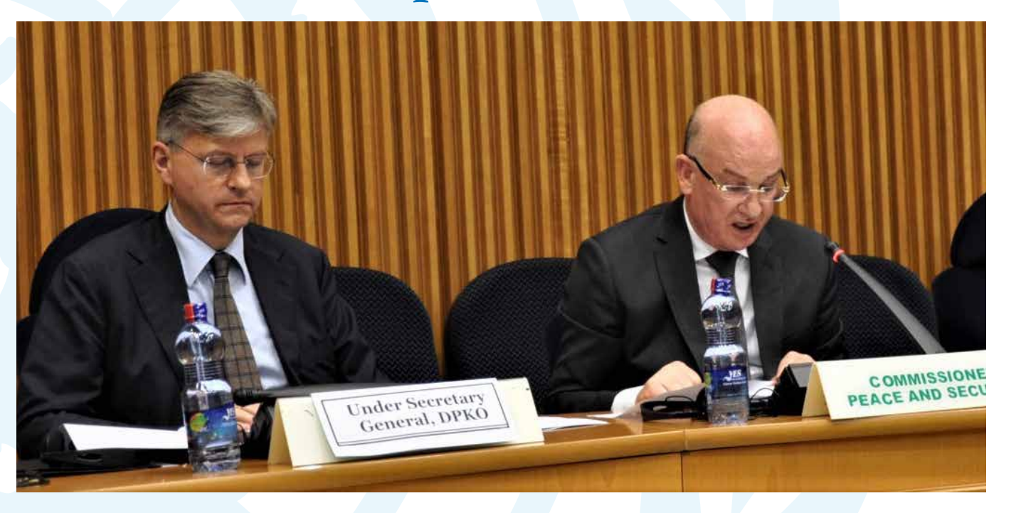
United Nations Under Secretary-General for Peacekeeping Operations, Jean-Pierre Lacroix (left) and the African Union (AU) Commissioner for Peace and Security, Smail Chergui (right) briefing AU Peace and Security Council Members

The United Nations Under Secretary-General for Peacekeeping Operations, Jean-Pierre Lacroix, and the African Union (AU) Commissioner for Peace and Security, Smail Chergui, jointly briefed the AU Peace and Security Council (AUPSC) following their visit to the Central African Republic (CAR) and Sudan on 13 April. Regarding the situation in CAR, USG Lacroix and Commissioner Chergui noted that tensions remained high following recent violence in the PK 5 area of Bangui. They called for continued UN-AU collaboration, particularly to ensure that all actors participate in good faith in the peace process. AUPSC members paid tribute to victims of recent fighting in CAR, including peacekeepers and urged for concerted efforts towards the restoration of the rule of law and a renewed impetus for dialogue.