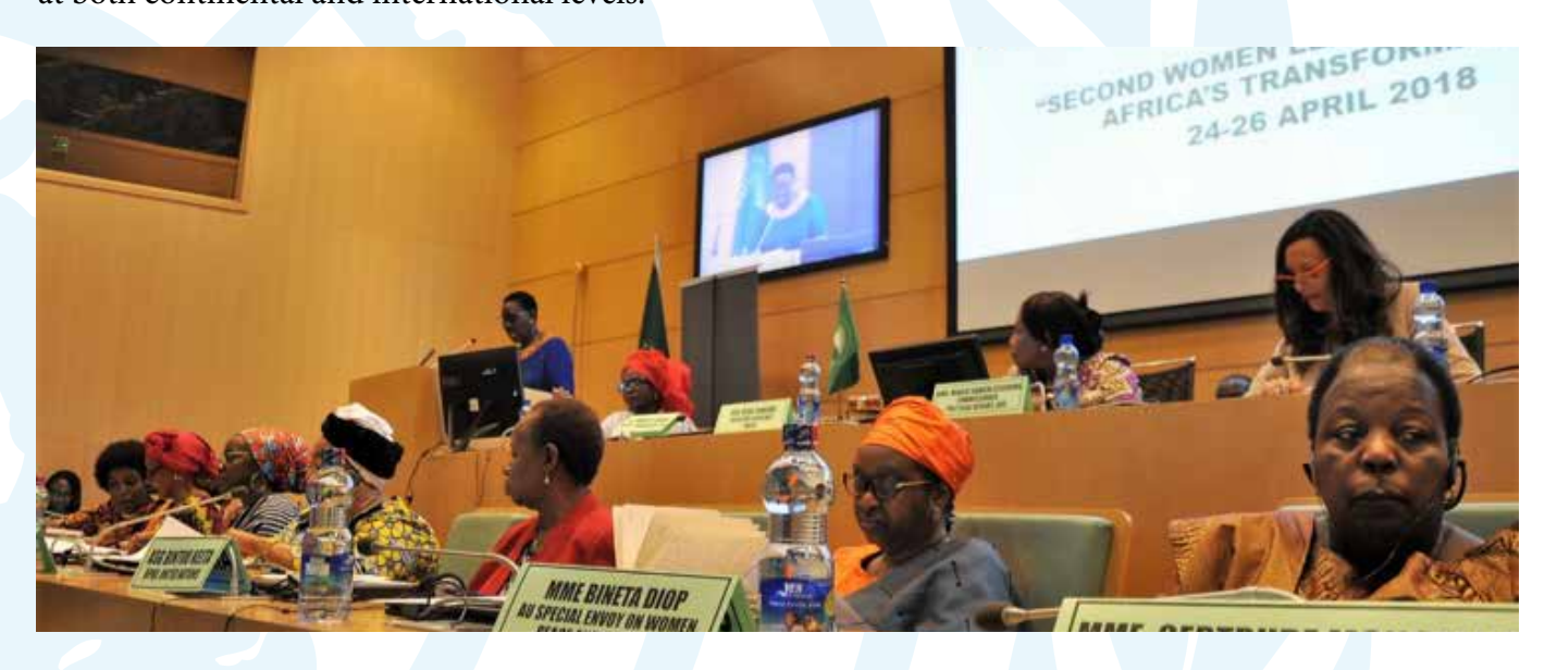
Assistant Secretary-General for Peacekeeping Operations, Bintou Keita (center) at the second African Women Leaders Network Forum (EWLN) during a session on national chapters

On Gender: Speaking at the 2nd High-Level Women Leaders Forum for Africa's Transformation in Addis Ababa in April, ASG Keita stressed the importance of women's participation and leadership in peace and security initiatives, which would ensure that African women have the power to influence debates and programmes on issues of governance, security sector reform, justice and rule of law, and economic recovery. She added that gender-specific perspectives were key to successful conflict resolution and sustaining peace. ASG Keita called for an increase in African women's leadership and influence in peacekeeping operations, including as Force Commanders, Police Commissioners, Chiefs of Staff or Heads of Political components, at both continental and international levels.