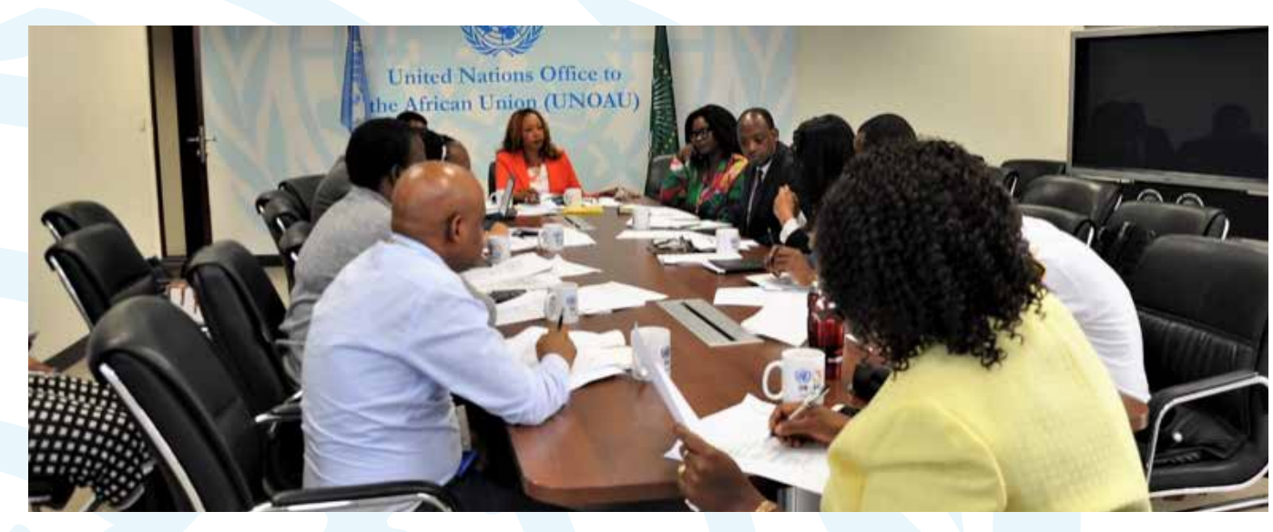
Representatives from UNOAU, UNWOMEN, ECA, AU and UN Resident Coordinator's Office at a planning meeting hosted by UNOAU ahead of the African Women Leaders Network Forum in April, 2018