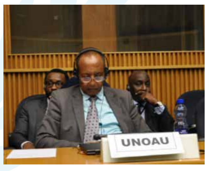
Special Representative of the Secretary-General, Haile Menkerios at the AU Peace and Security Council session on the nexus between corruption and conflict in Africa

UNOAU Special Bulletin: March- May, 2018 19