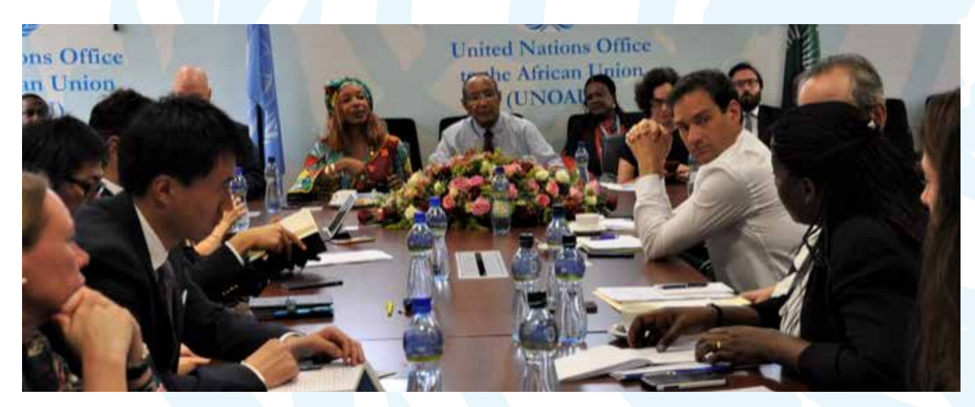
In April, UNOAU welcomed members of the Fifth Committee who visited UN offices in Addis Ababa