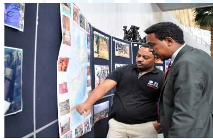
Participants learn about mines at the Mine Action Day exhibition hosted by the United Nations Mine Action Service (UNMAS) Office in Somalia at African Union Headquarters

The International Mine Action Day was marked on 4 April at the AU Headquarters by the AUC, AU Member States, UN and partners under the theme 'Advancing Protection, Peace and Development'. While successes have been registered by countries through on-going efforts to reduce the risks associated with land mines, explosive remnants of war and Improvised Explosive Devices (IED), it was noted that more needs to be done. Increasing resource mobilization, developing personnel capacities and sharing information were some courses of action highlighted as recommendations.