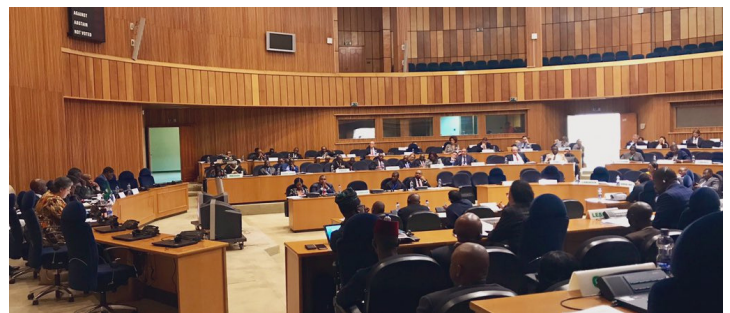
April 3, SRSG Tetteh delivered a statement at the AU Peace & Security Council session on prevention of the ideology of hate, genocide & hate crimes