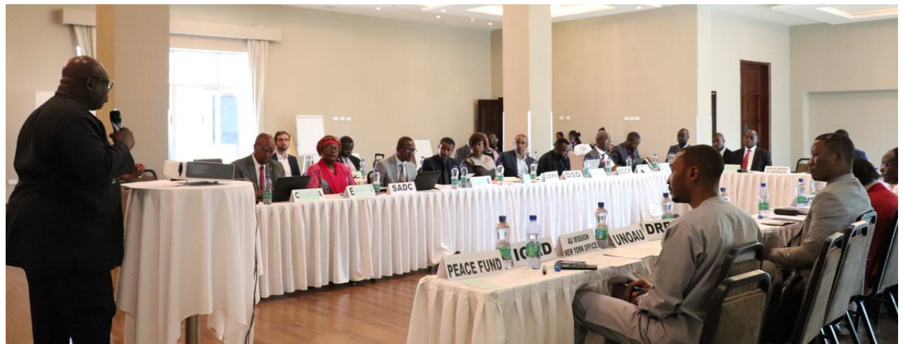
UNOAU participated in an experts' workshop aimed at developing a two-year action plan to fast track the African Union's Silencing the Guns initiative. The workshop took place in Addis Ababa on 18 April