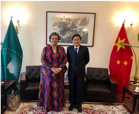
Ambassador Liu Yuxi of China to the African Union received SRSO Tetteh in courtesy call that explored collaboration to enhance the UN - AU partnership in peace and security in Africa