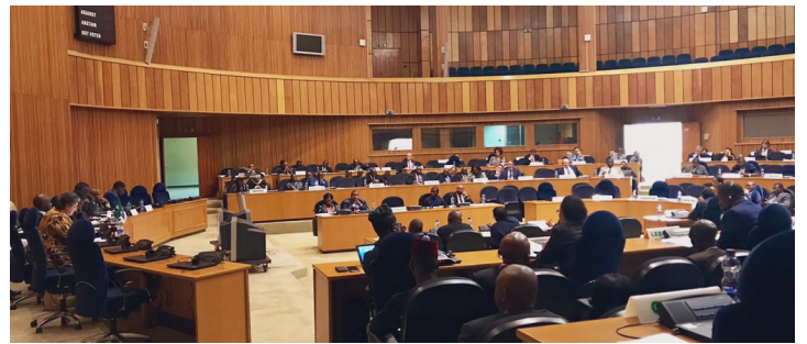
April 3, SRSO Tetteh delivered a statement at the AU Peace & Security Council session on prevention of the ideology of hate, genocide & hate crimes