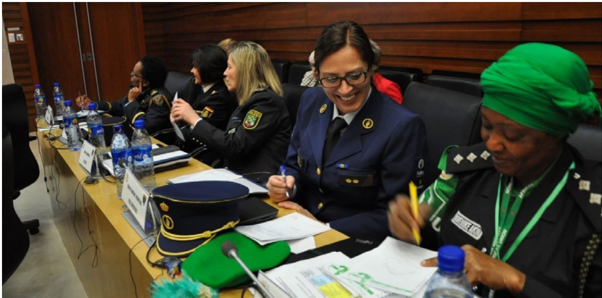
First Female Police Commanders Course, 3rd – 8th December 2017

This policy brief has outlined the opportunities for the digital inclusion of women in Africa's WPS Agenda, be it for preventative measures and early engagement to facilitating effective mobilisation that holds the potential to lead to political change towards peace. There have also been calls for the WPS Agenda to be less traditional in its thinking of security and be more conscious that emerging and new technologies also mean a need for more deliberate efforts towards improving cybersecurity. This is particularly important as surveillance and spying technology development will significantly impact the extent to which digital inclusion of women can be achieved. Whilst technologies like AI, Machine Learning,