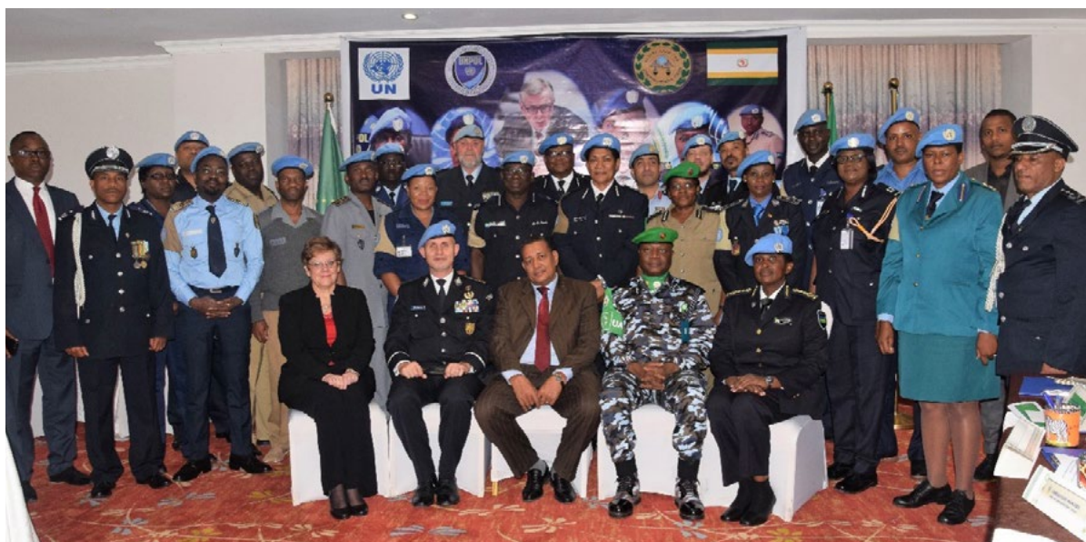
Heads of UN missions police chiefs meet in Addis Ababa at the 3rd Heads of Police Components retreat. 31 July – 2 August 2018.

Since the four pillars were established in 2000, initiatives such as Safe Cities and Safe Public Spaces for Women and Girls have emerged using digital tools as one of the implementation methods in local communities. In Maputo, Mozambique, school girls and boys have held workshops to discuss critical issues around making the city safe for women and girls. Following this activity, social media was used to promote the voices and suggestions of schoolchildren and policy changes to support new safety measures. Using social media made these suggestions public, increased